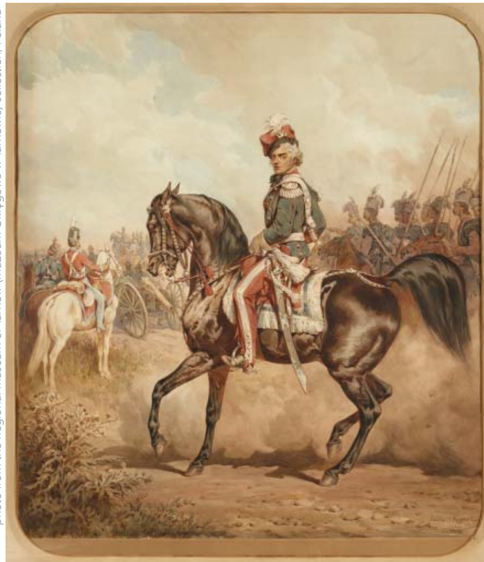
Juliusz Kossak: "Portrait of Eustachy Erazm Sangusko" (1871)