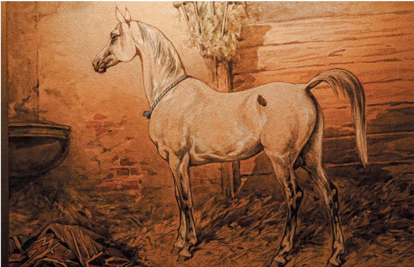
Juliusz Kossak: "Bagdad" (1890). Property of Chrcynno-Palace Stud

Żeromski, Stanisław Witkiewicz, Henryk Sienkiewicz, Teofil Lenartowicz, Henryk Rodakowski, Józef Chełmoński, Wojciech Gerson, Jan Matejko, Jacek Malczewski.