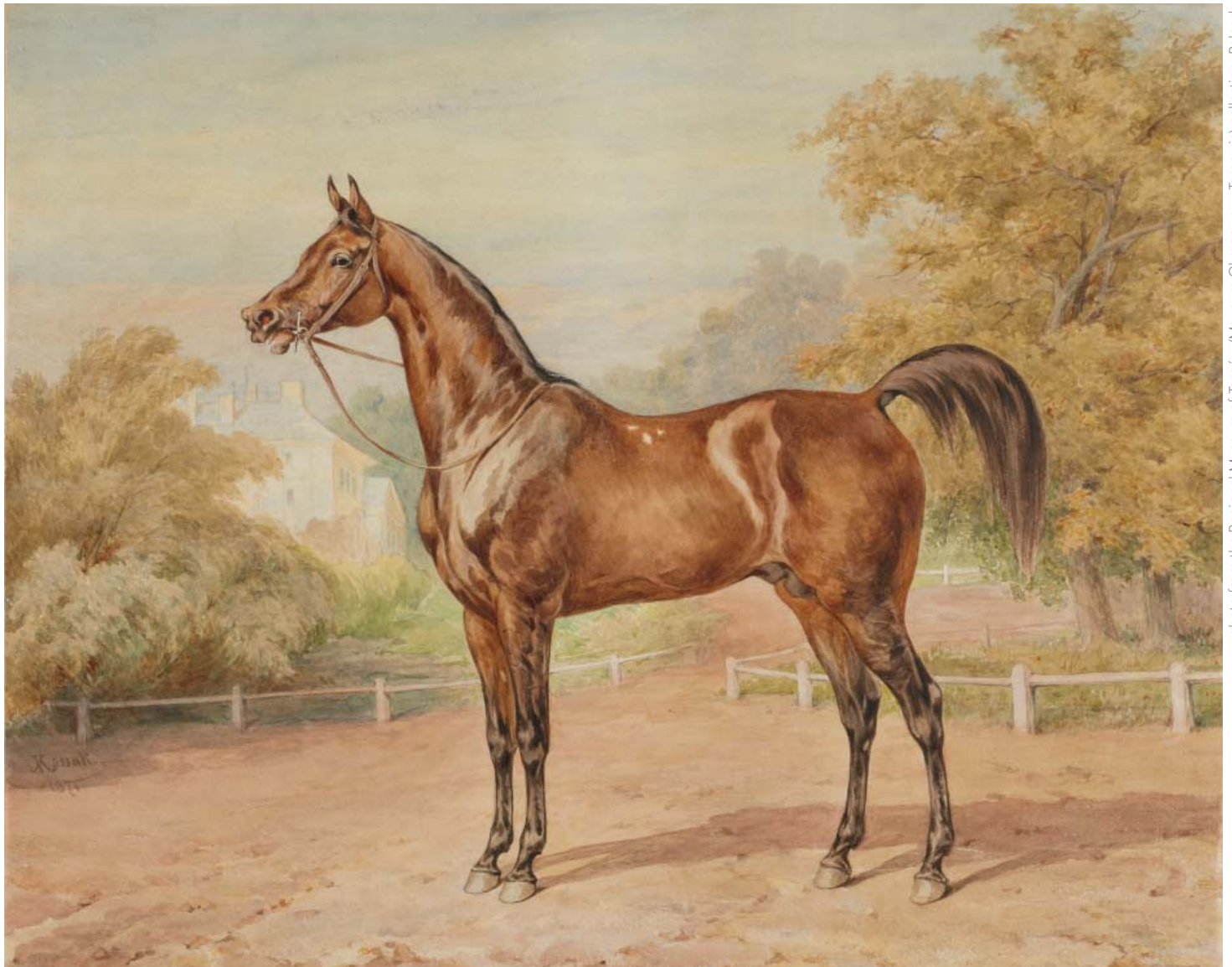
Juliusz Kossak: "Chestnut horse Carogród" (1875)