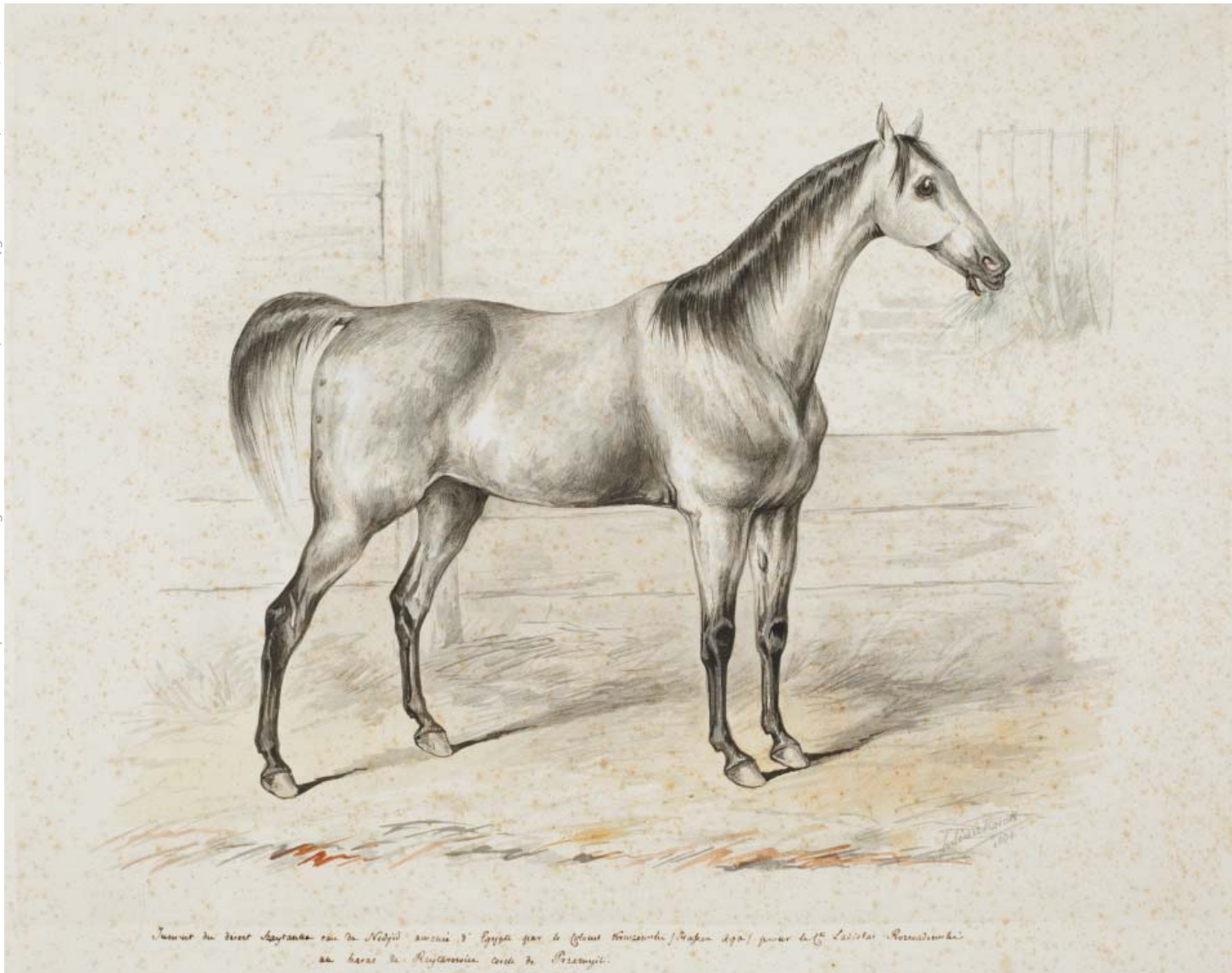
Juliusz Kossak: "The grey mare Szaytanka" (1844)

still had herds of horses galloping across them. Including their most beautiful version, Arabian.