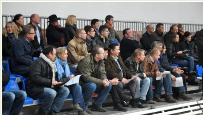
The audience at the horses' presentation